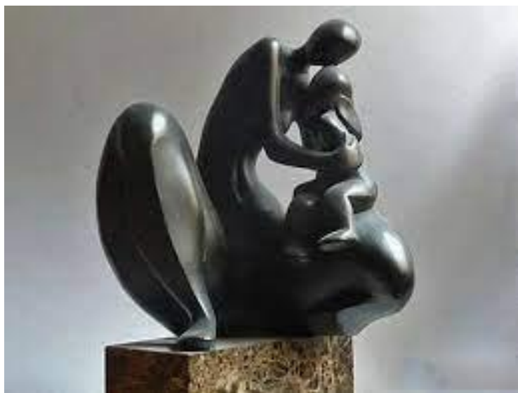
Reference Image 03