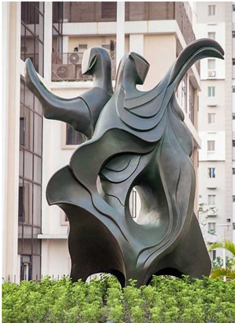
Reference Image 01